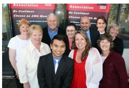
- from your AWA team