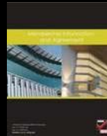
Membership Information and Application Kit