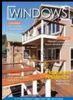
WINDOWS - March 2009